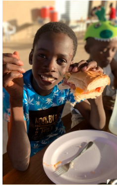
Hamburgers for dinner

The Bible says, “Be very careful, then, how you live—not as unwise but as wise, making the most of every opportunity, because the days are evil” (Ephesians 5:15-16). The days are “evil” because they do not lend themselves to the kind of behavior that makes the “most of every opportunity.” Instead, routine sneaks in and makes it difficult to intentionally think about life. But, camp offers our students