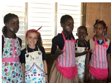
Writing and making recipes for a project in Language Arts class