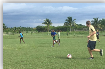
Saturday soccer game

which will build on that foundation. As students grow up and come into the elementary years, camp will be a part of their experience. Camp creates a reflective environment where things can be slowed down and “the bell” doesn’t ring. It offers a low camper-counselor ratio. In that atmosphere, our staff have the opportunity to deepen relationships with students and help guide their thinking as they learn to process their experiences from a biblical perspective.