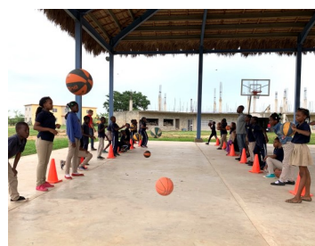
Practicing bounce passes